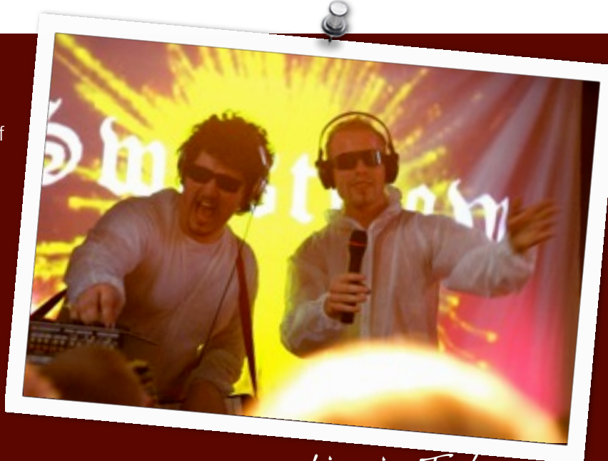
Live in Tokyo 1997

This film serves to spread the gospel of the cow & infect a whole new generation with the group who perfected the bass-line. Incidentally the film was banned in Israel & Austria 6 months prior to its release.